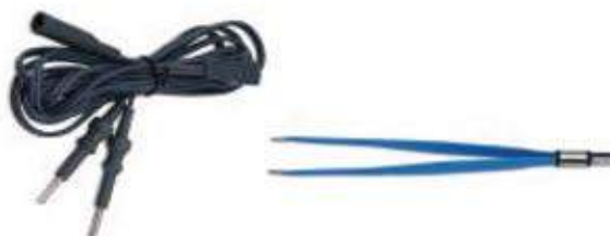
BIPOLAR FORCEP WITH CABLE