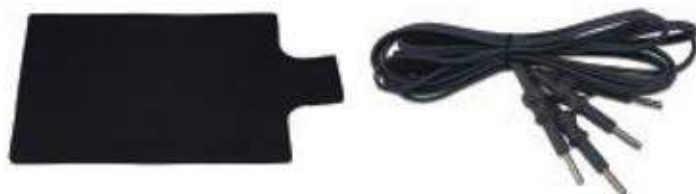
SILICON PATIENT PLATE WITH CORD