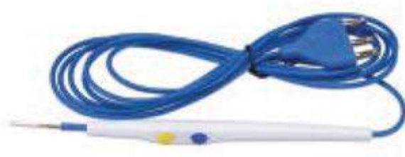
DISPOSABLE HAND SWITCH PENCIL