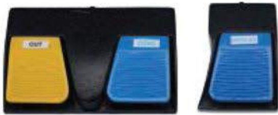
MONOPOLAR / BIPOLAR FOOT SWITCH