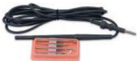
CHUCK HANDLE WITH ELECTRODES